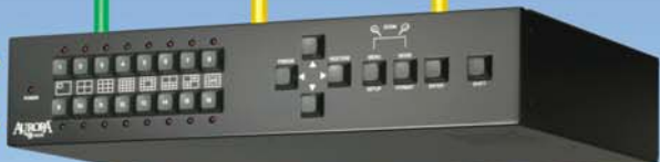
AURORA Digital Video Multiplexer