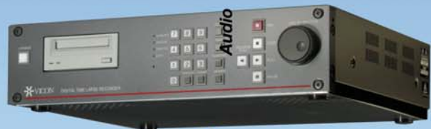
VDR4000 Digital Recorder