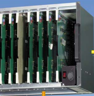
MATRIX66 Super-High Density Matrix Switcher