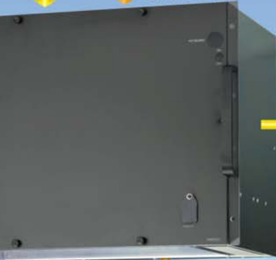
MATRIX66 Super-High Density Matrix Switcher