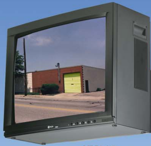
VM628 High-Resolution 28" Monitor