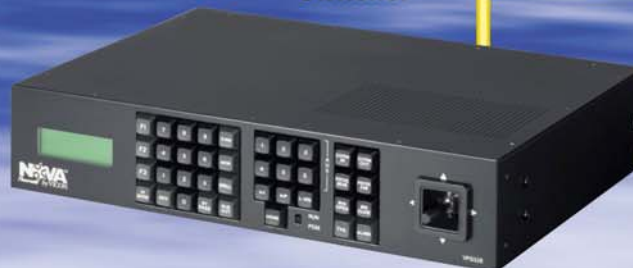
Nova RS-422/Vicoax CPU and Matrix Switcher