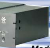
Nova Modular CPU System